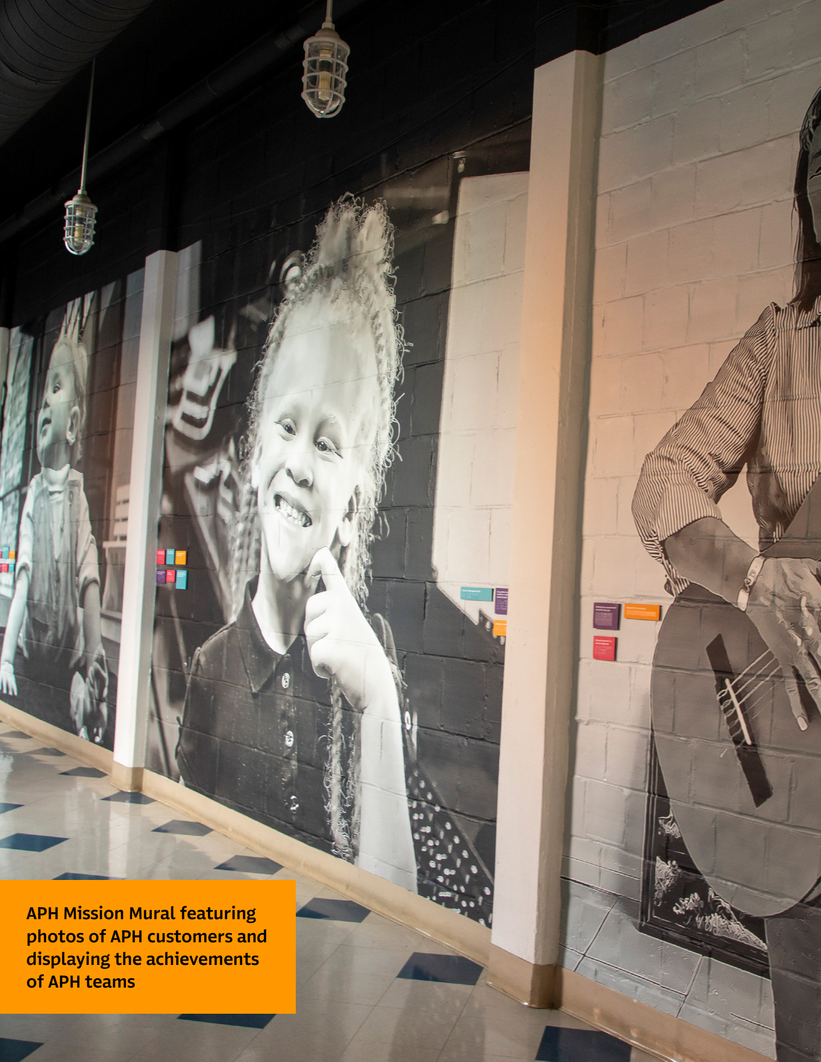
APH Mission Mural featuring photos of APH customers and displaying the achievements of APH teams